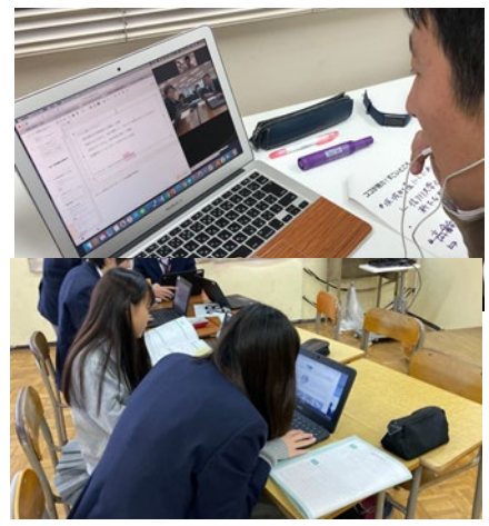
Online learning support

Service: One-on-one consulting during STEAM project learning, consultation related to coursework, and consultation related to paths after graduation