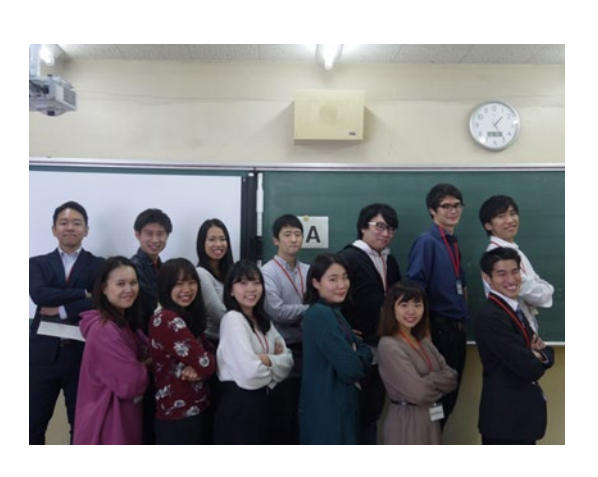
Tomonokai Learning Mentor Team @ Future Classroom Project