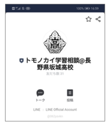
LINE Official Account