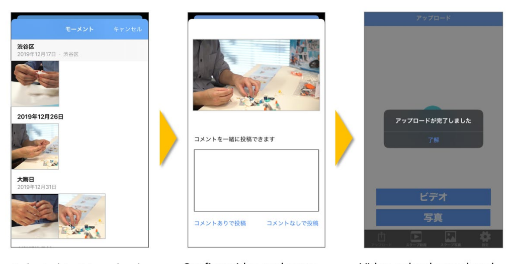
Select object to upload.