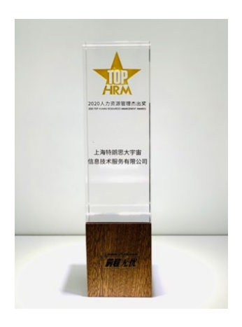
"2020 Top HRM Awards" plaque

transcosmos China places great importance on growing together with its employees, and always tries to create and offer better employee benefits packages, workplaces, educational programs and career paths for employees. At the same time, the company continues to build trust with its talents by creating many quality jobs and offering more job opportunities for the disabled persons, and communicating with its employees in real time via social network services (SNS). Being selected as the award winner from various companies is a testament to transcosmos China's success in winning recognition for its HRM skills within the Chinese HR industry.