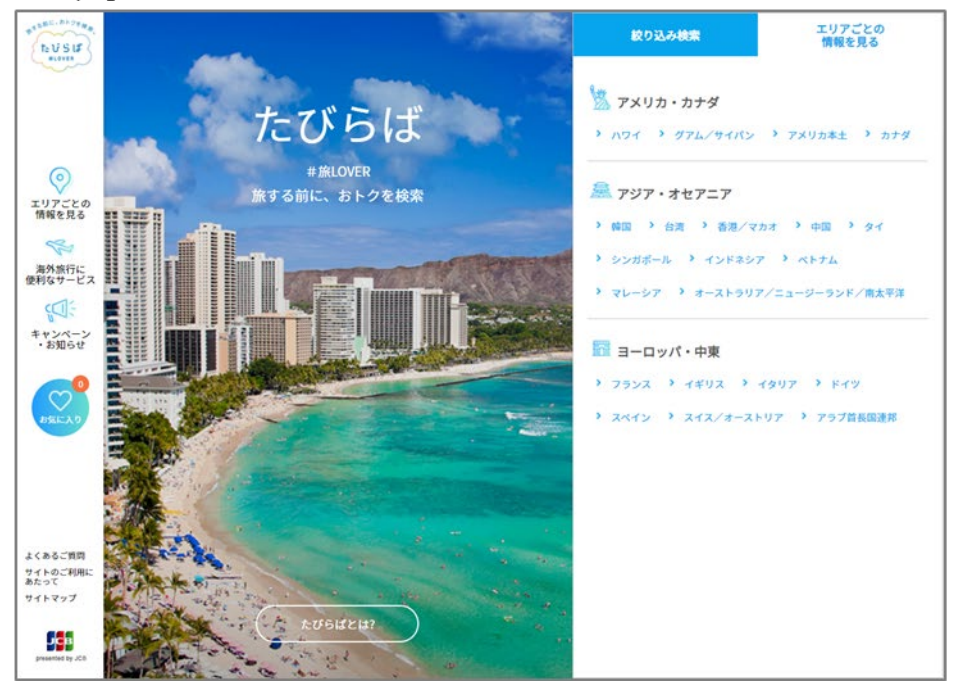
Webpage for mobile