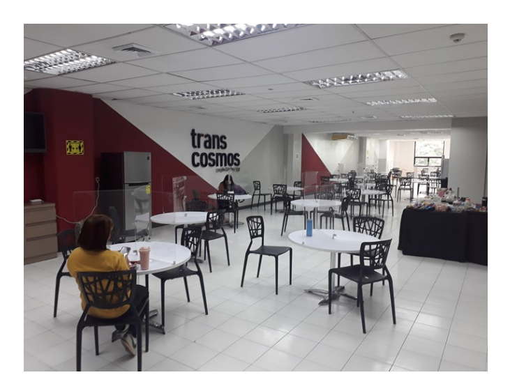
<Open Office Space>