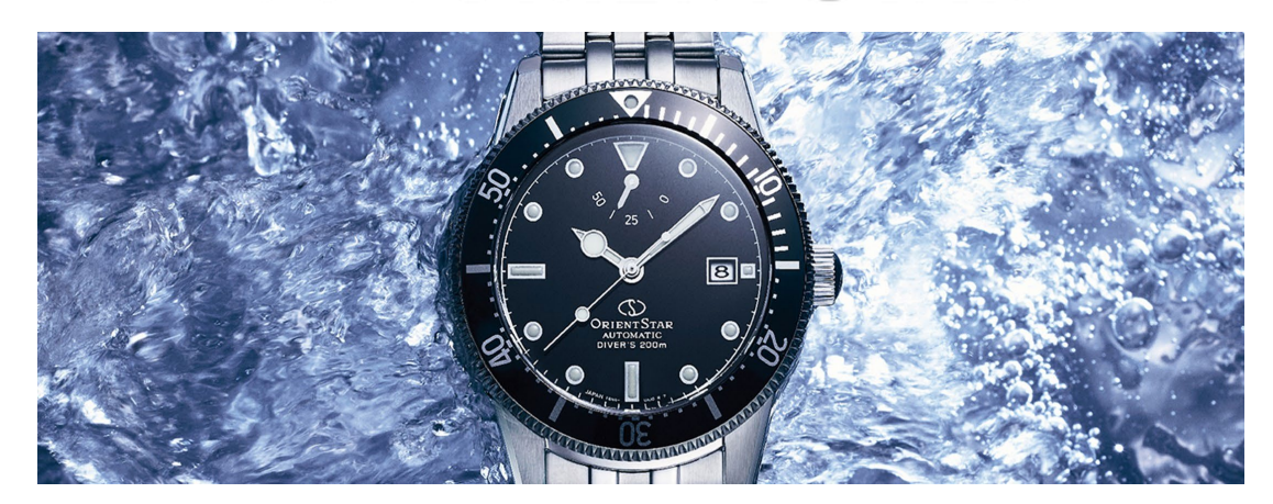
Visit "with ORIENT STAR" official website here (no translation available): https://orientstar-watch.com/ Visit transcosmos customer case study here (no translation available): https://www.trans-cosmos.co.jp/customercase/customer/epson.html

"with ORIENT STAR" is built on a concept of unraveling the three pleasures that ORIENT STAR pursues, from three perspectives – Style with Technology, Craft with Art, and Time with Story – and communicate and weave a close relationship with the brand's customers. Chosen as its partner, transcosmos has built a Shopify store for the brand with high-quality UI/UX that reflects the world view of ORIENT STAR brand, presenting content that only official online stores can offer. At the same time, transcosmos has also put in place a one-stop shop service framework that ranges from purchase and sell, marketing promotion, phone and e-mail customer service channels, to logistics including order and inventory management.