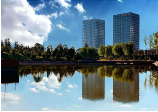
Building where Xi'an Center is located (Left)