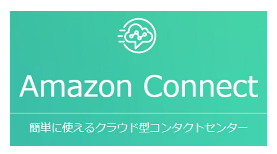
Simple to use, cloud-based contact center

transcosmos inc. (Headquarters: Tokyo, Japan; President and COO: Masataka Okuda) is now developing new services that utilize "Amazon Connect," a cloud-based contact center service by Amazon Web Services Japan (AWS). transcosmos plans to deliver its new contact center services to clients when "Amazon Connect" becomes available in the Asia Pacific (Tokyo) AWS Region in the coming months.