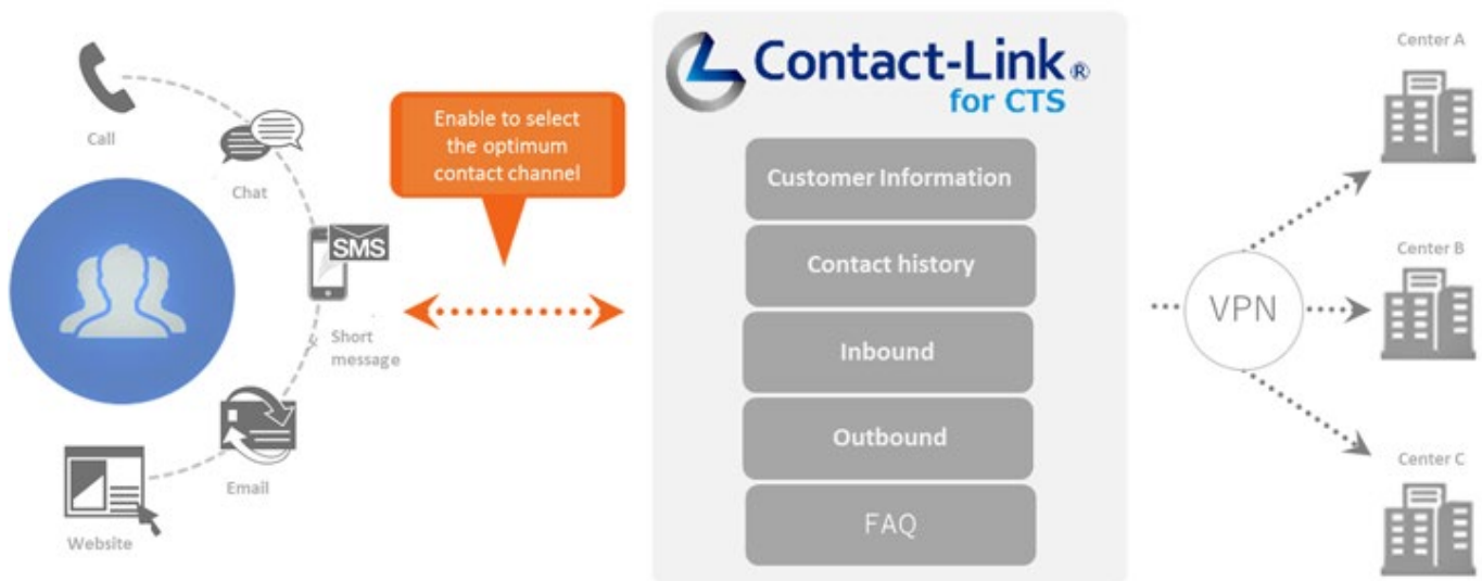
A cloud-based central management platform provides centralized control over all customer inquiry channels

* transcocosmos is a trademark or registered trademark of transcocosmos inc. in Japan and other countries.