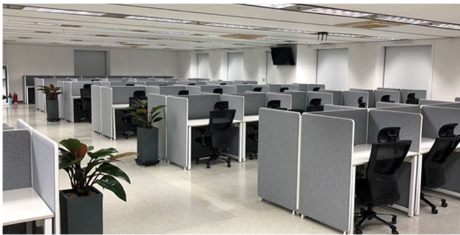
<Busan Center No.2 Operations Room>