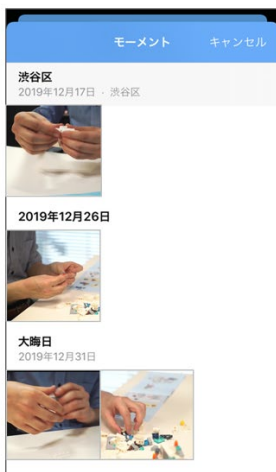
Select object to upload.