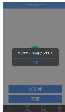
Video upload completed.

*Visit service demonstration video here: https://youtu.be/HPfXxkEXU_Y