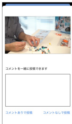
Confirm video and enter comment. Comment is not mandatory.