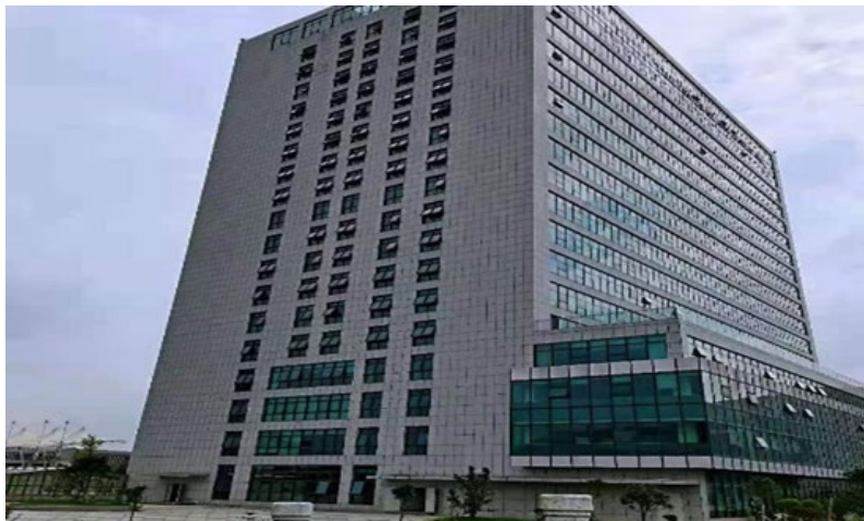
The building where Changsha Campus Center is located