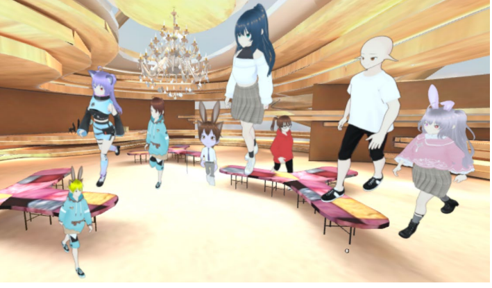
Creating an avatar