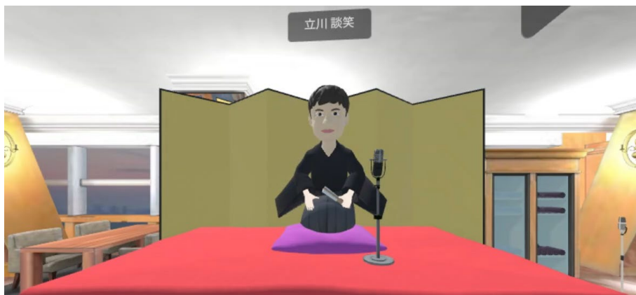
Rakugo master Dansho Tatekawa performs rakugo on the spot

This will be the second metaverse radio public show recording, which interlocks the metaverse and radio - a media which has been entertaining people for years. On the theme of communication, the program aims to deliver new ways of entertainment and communication that only metaverse radio can offer, co-creating a whole new experience with listeners. The program includes piano improvisation based on given notes from listeners and a rakugo story created on the spot based on three topics also given by listeners.