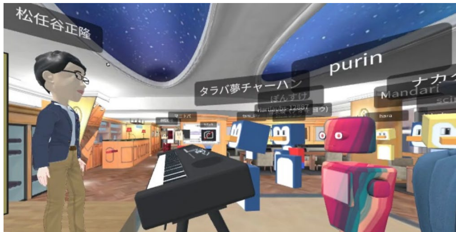
Personality Masataka Matsutoya improvising on the piano